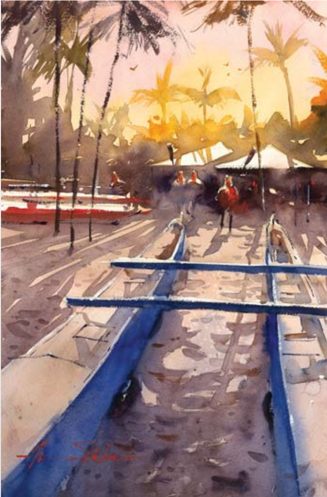
"King Kam Boat Rentals" by Ron Stocke

It's not too late to sign up for this fun and informative workshop!