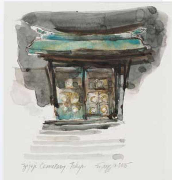
"The Zojoji Cemetery Gate"