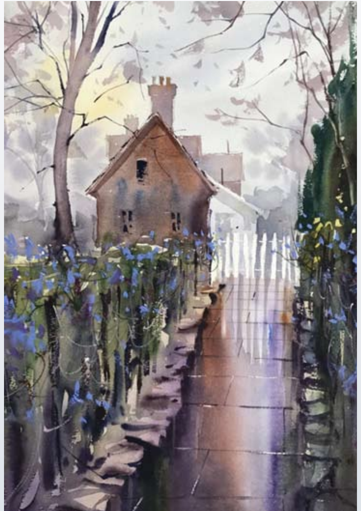
"The English Garden" by Ron Stocke