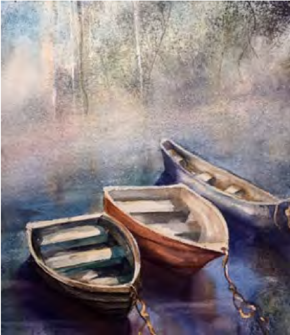
Waiting Boats Sandy Melander-Schlidt 18" x 16" $850