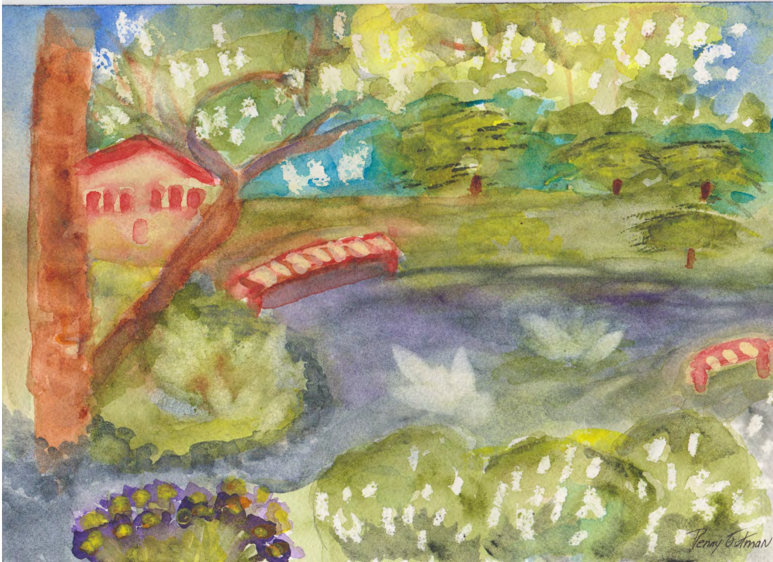
Japanese Garden Penny Gutman Link 7" x 10" NFS

I grew up in Boston. I have been painting with watercolors for years. I love painting seascapes, landscapes and all florals.