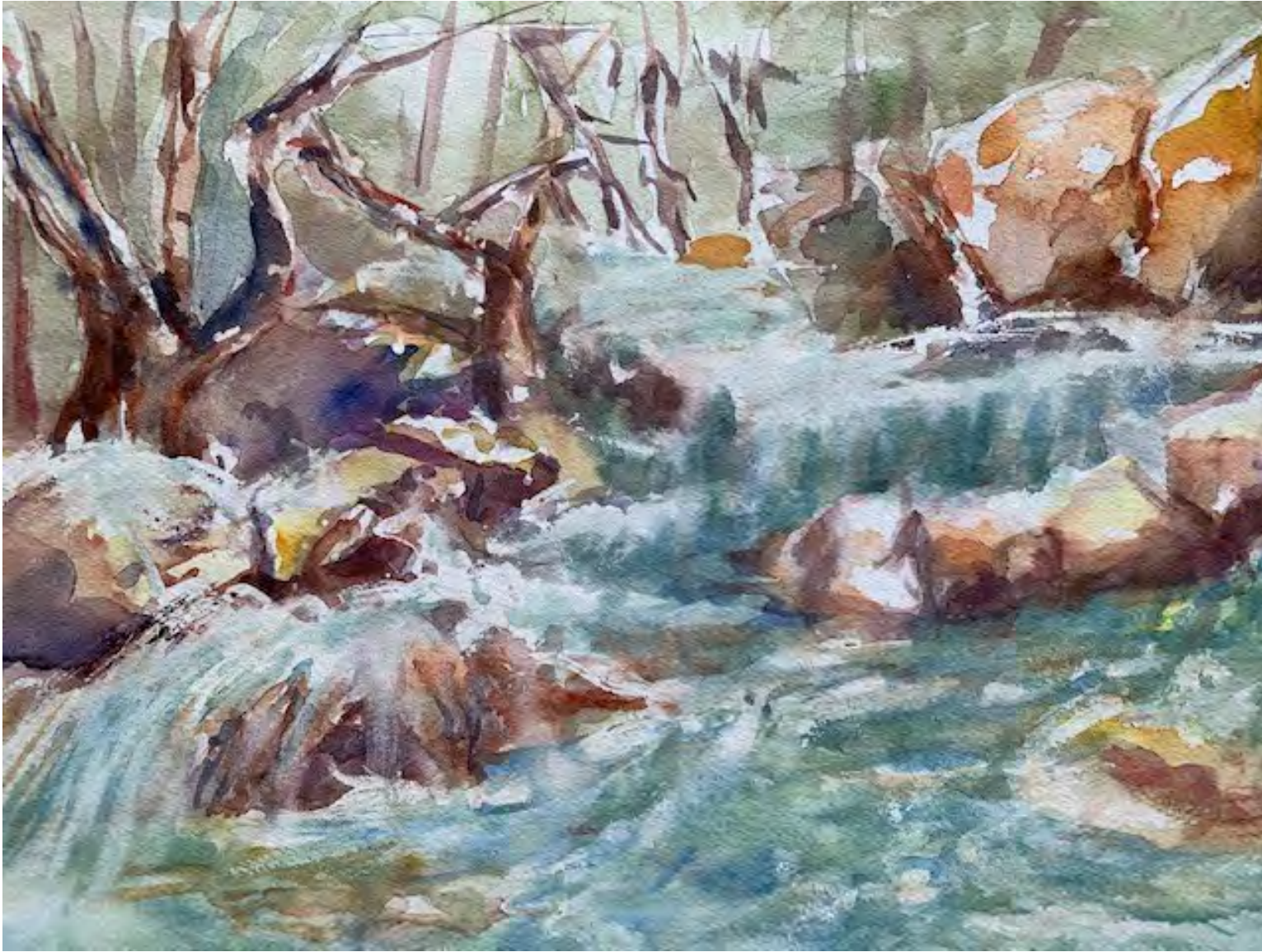
River Runoff Joan Knight Orozco 12" x 16" $180

Water is always changing, offering moods, reflection, turbulence, value changes, or joy. The river runoff can be a Spring event or a weather result. I love the fluidity of watercolors in evoking the realm of water.