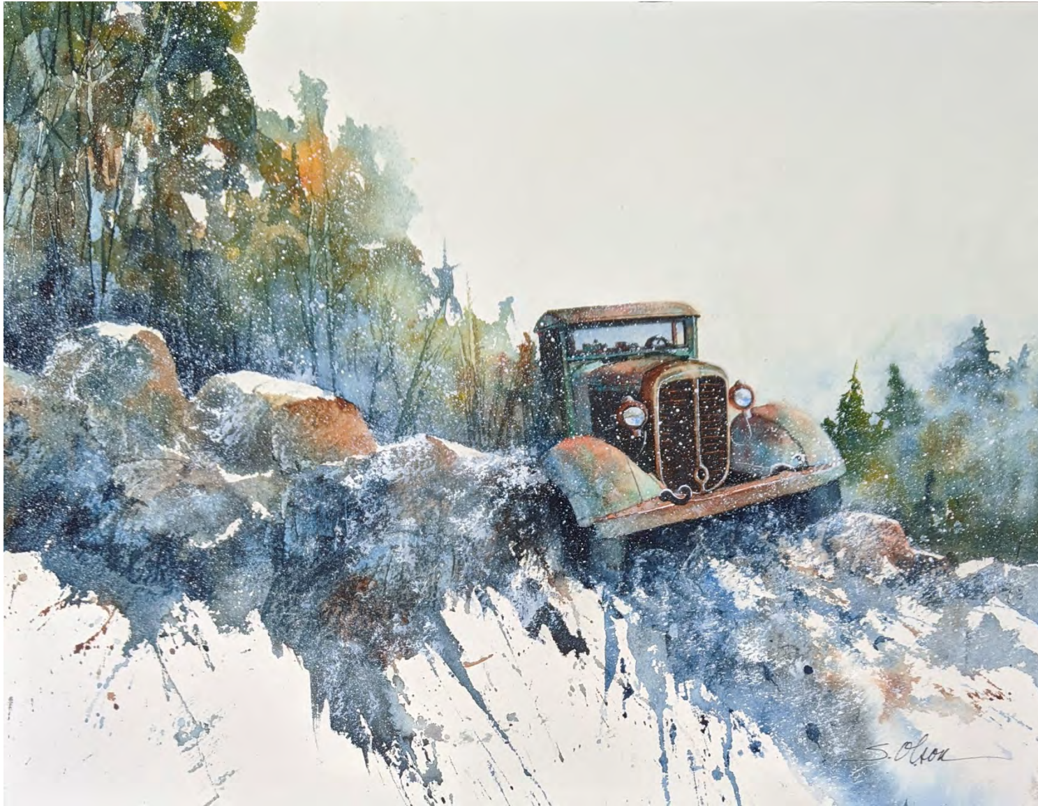
Feeling Blue Sue Olson 13" x 17" NFS

"Feeling Blue" is one of a series of three paintings based on my photograph of an old truck at the Gold King Mine in Jerome, Arizona. I tried to capture the mood of a winter scene with the truck surrounded by rocks and snow.