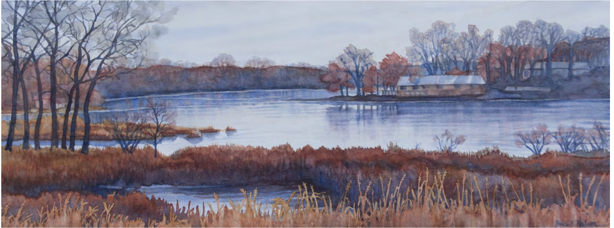
Winter Ice Heidi Nelson 10" x 26" $850