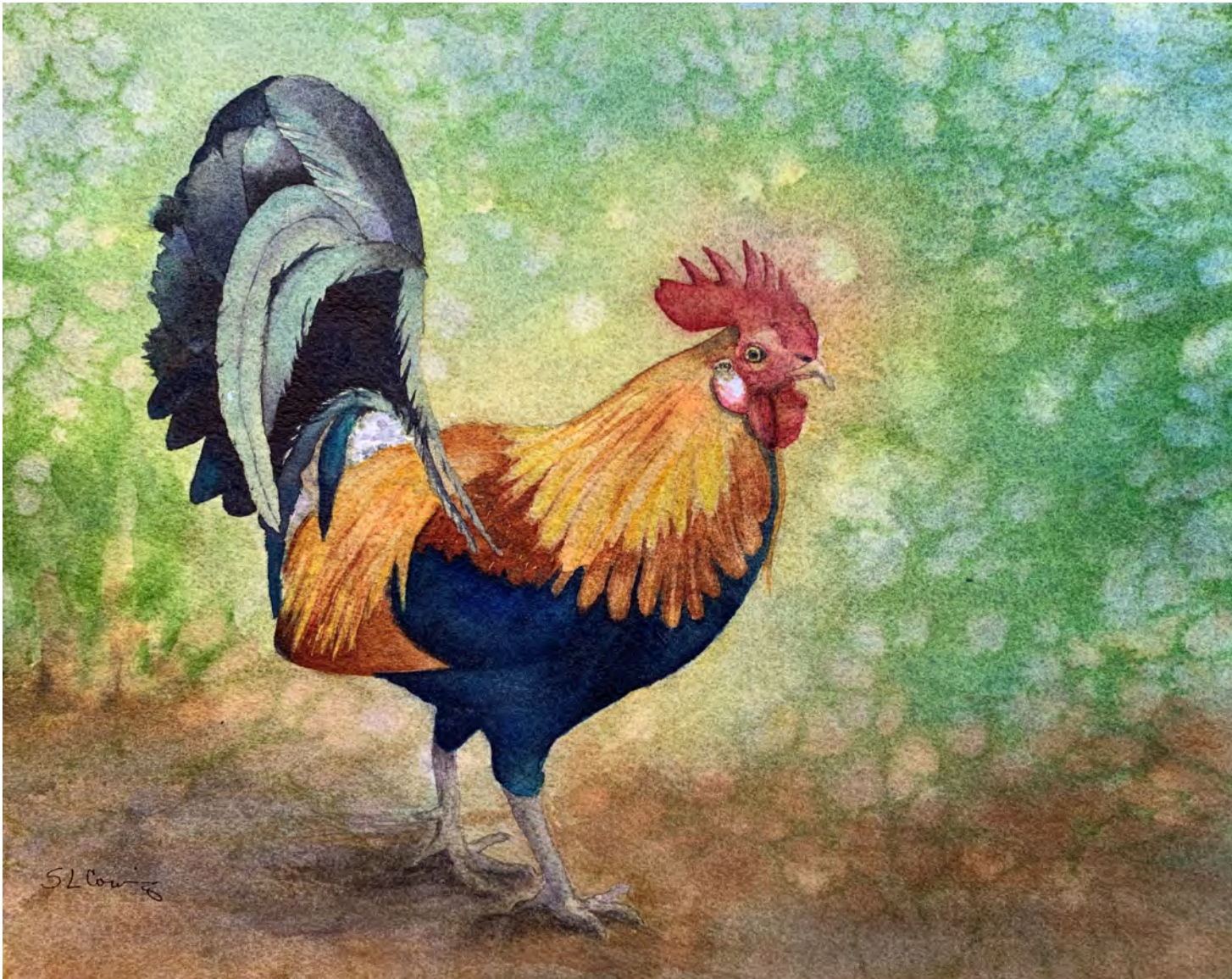
Jungle Fowl Sandra Cowing 9" x 12" NFS