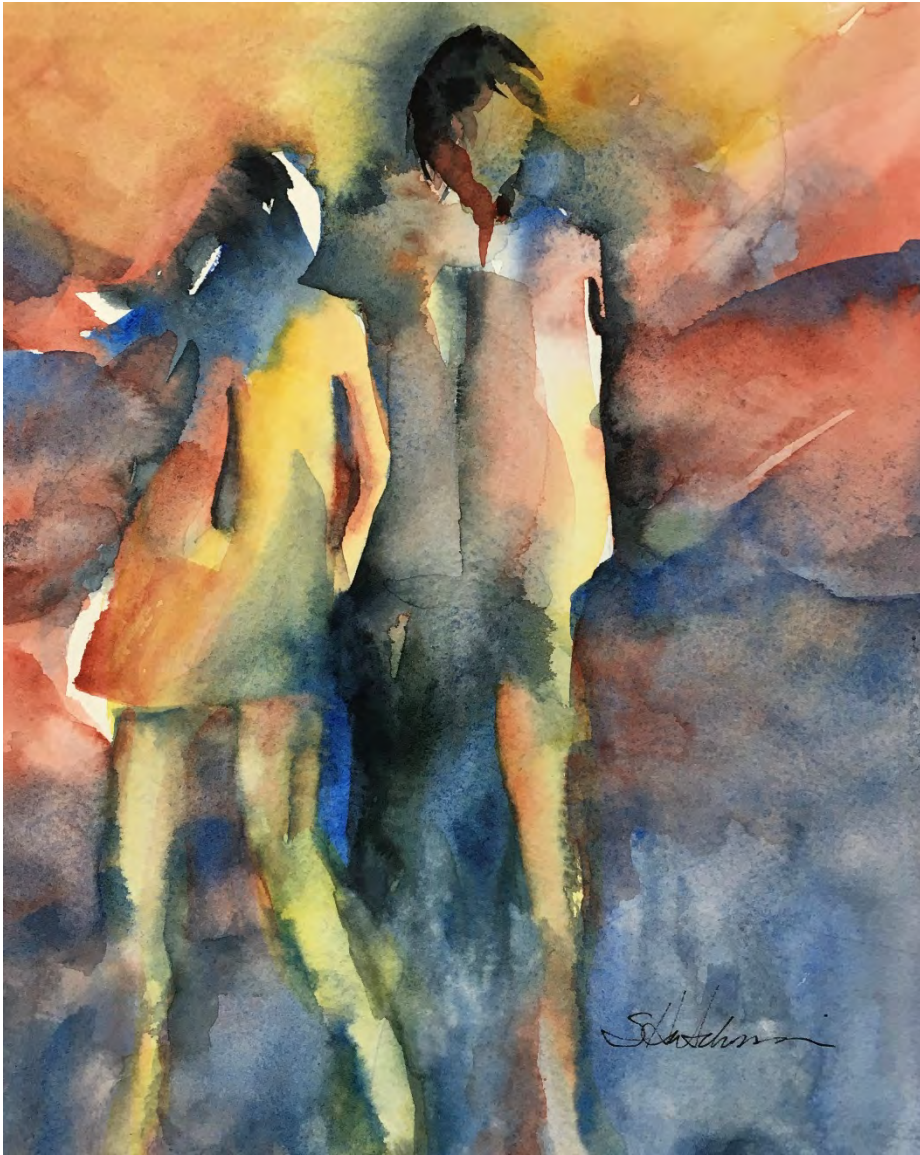
Seekers Sonja Hutchinson 12" x 9" $425

For me, painting in watercolor is where spontaneity and intention collide. I find it stimulating to use processes and tools that both challenge and celebrate the fluid nature of this medium. The paintings that excite me the most tap into shared experiences and emotions.