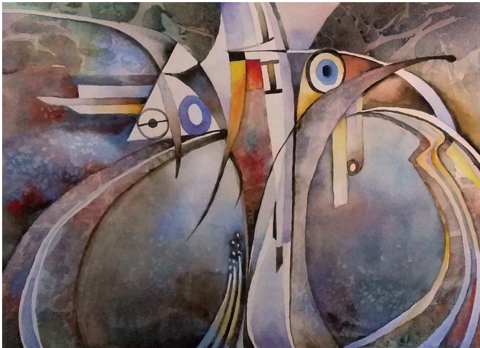
Convergence Richard Green 16" x 22" NFS