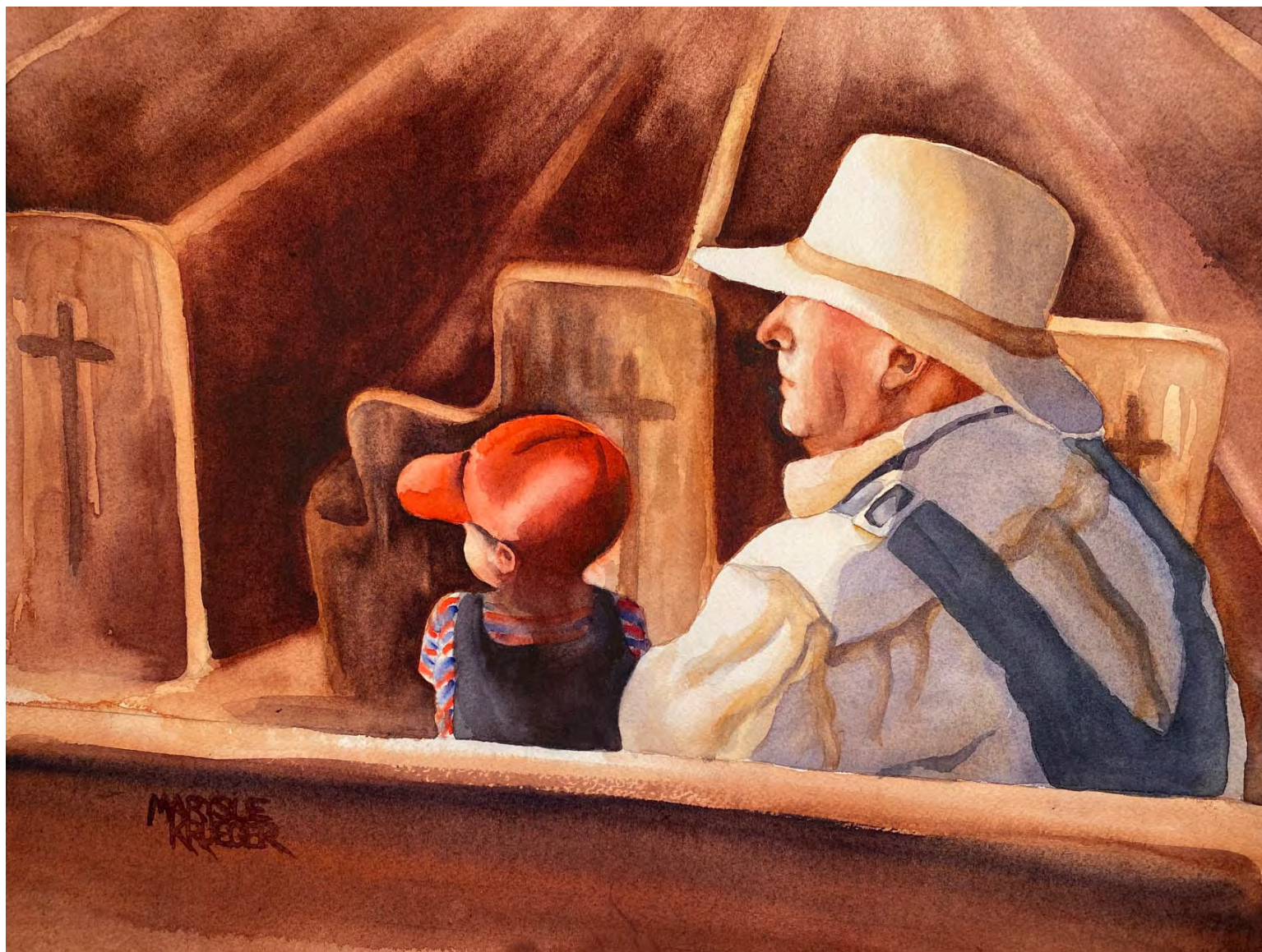
Across the Ages Mary Sue Krueger 12" x 16" NFS