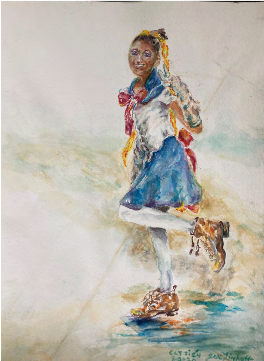
Cat Tien Joe Linhoff 12" x 9" $250