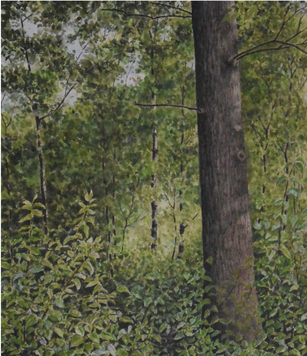
Forest Light Donald Aggerbeck 11.625" x 9.5" $500