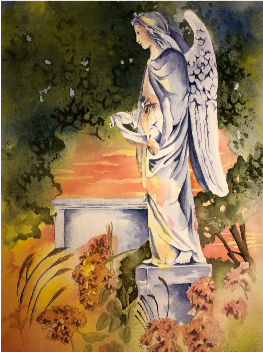
Statue in Hopkins at Sunset Carol Wingard