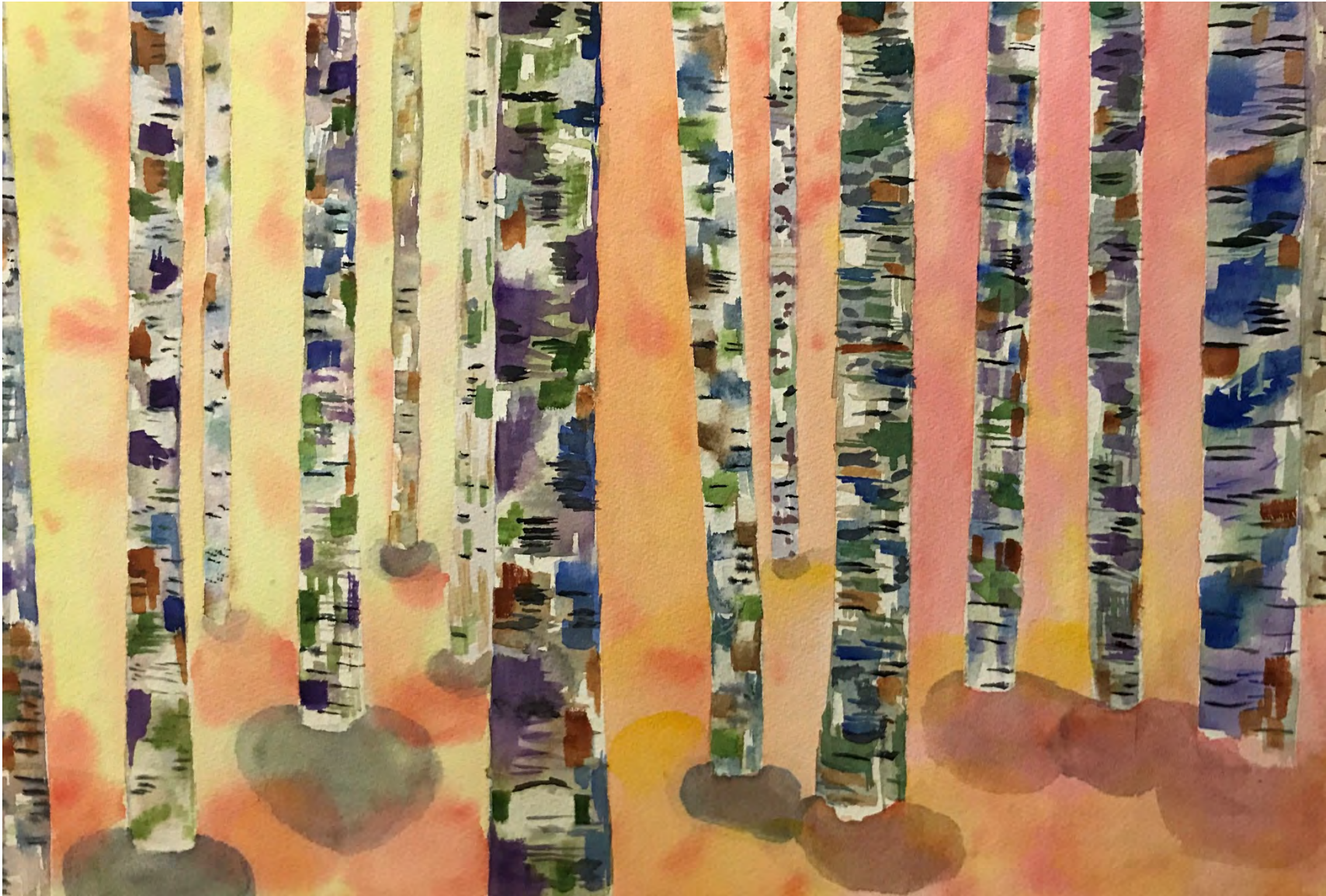
Disconnected Janet Bates 13.5" x 19.5" NFS

As I strive to figure out this new COVID-19 world, I often feel disconnected from what I believed to be "real." At times, it's like I'm floating through a surreal atmosphere wondering how things will ever be interconnected again. I am uprooted from what was. Yet, through all of these unique experiences, there is a beauty and symmetry of color as we stand in our separate silos of confusion waiting to someday to be brought together once more.