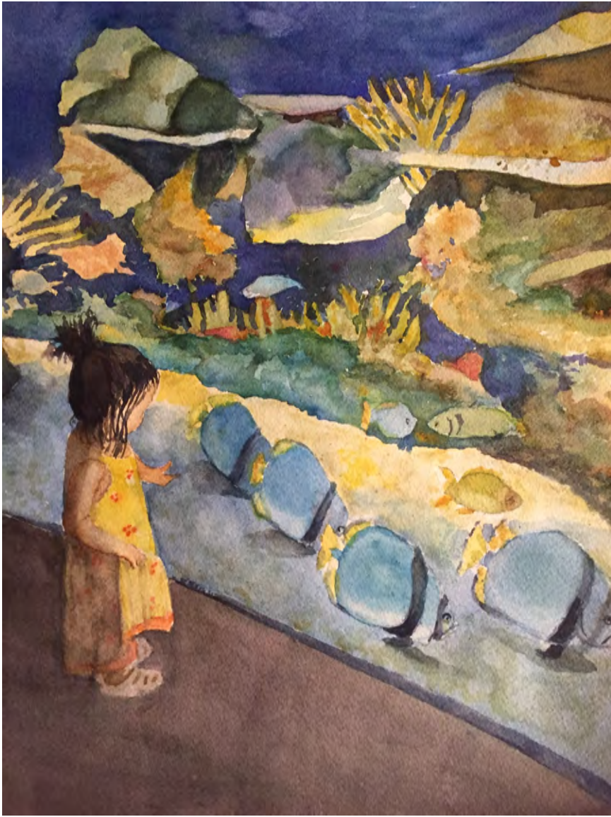
Fishy Fish Kathy Schur 12" x 9" NFS