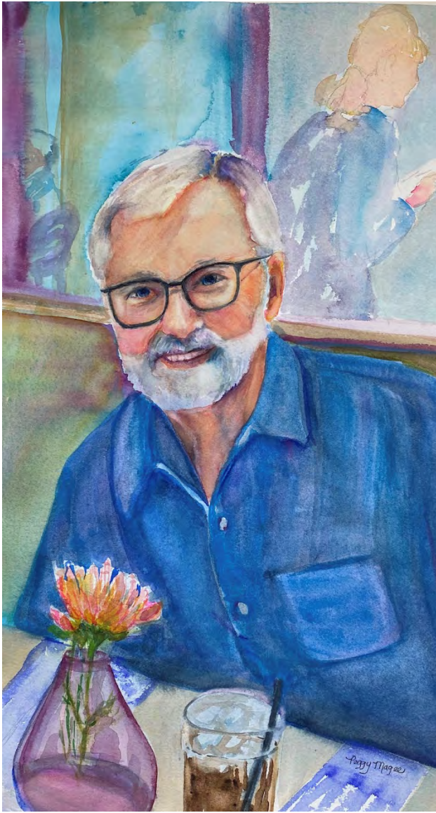
Lunch with Rob Peggy Magee 19" x 10.5" NFS