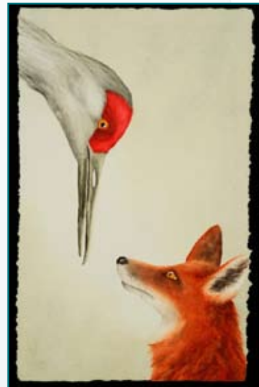
"Why Did You Invite Me?"