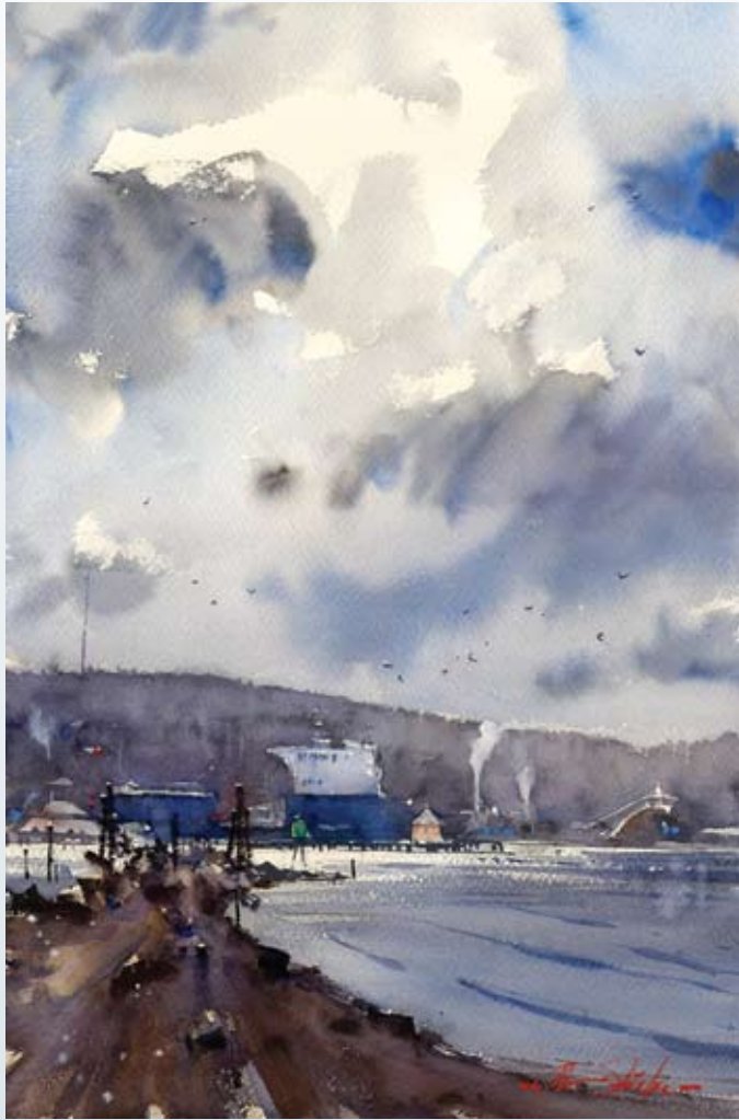
"Southern Tip Of Jetty Island"

The Minnesota Watercolor Society and the New Brighton Center are co-hosting this event.