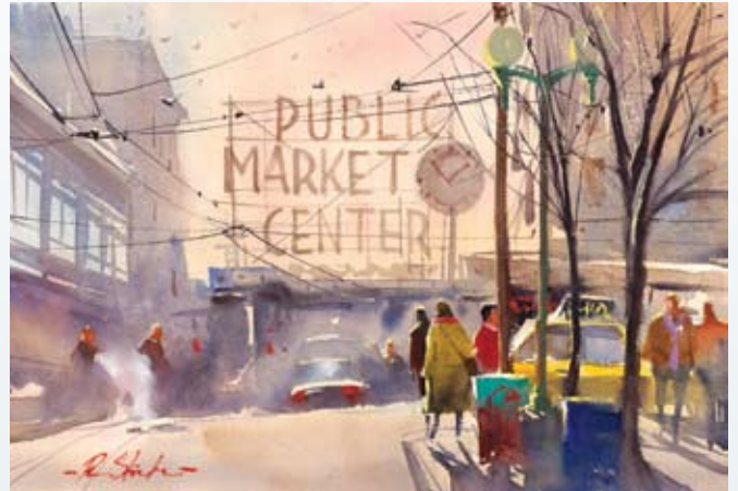
"Morning Market Seattle"