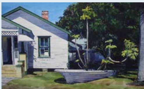
"Tree in a Boat", by Fred Dingler