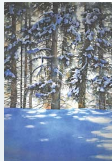
"Through The Trees"