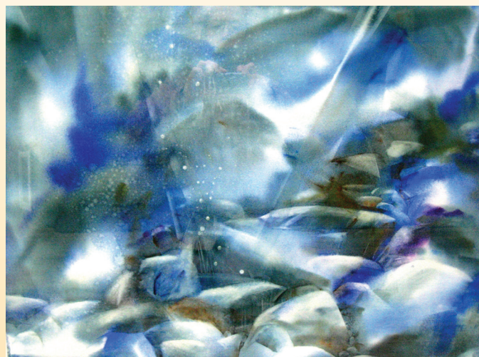
"Under Water Rocks" Demo by Suz Galloway