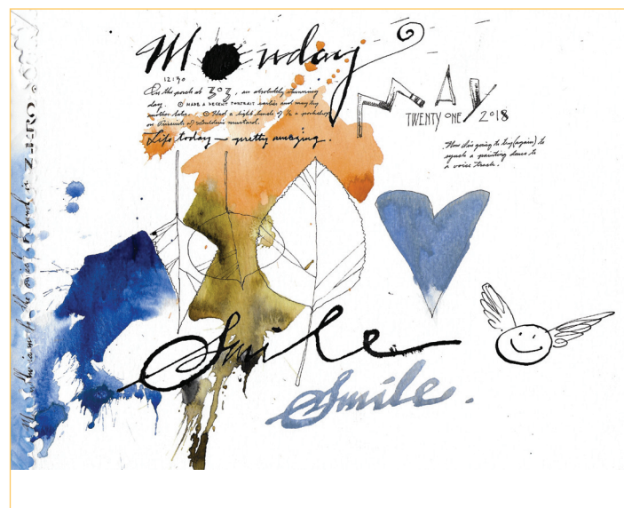
"Smile" by Stan Fellows

9 am - 4 pm at Ames Center, Burnsville, MN