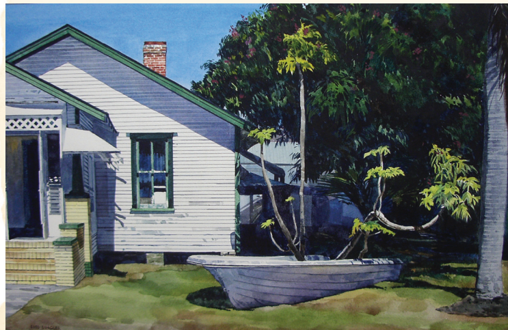
Honorable Mention "Tree in a Boat" by Fred Dingler