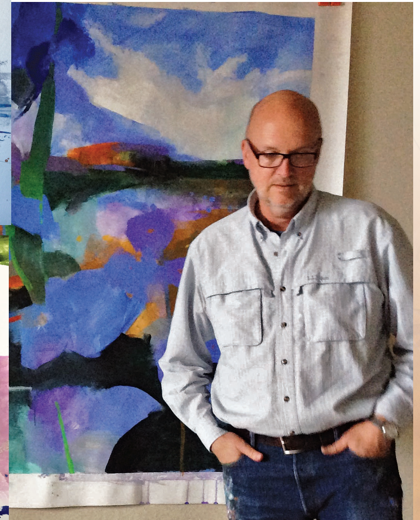
Journaling Pages by Stan Fellows