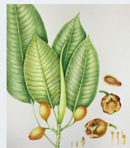
"N-T-S Paupua New Guinea"