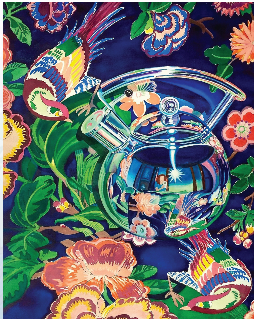
Best of Show 2019 MNWS Spring Show "Tea Birds", by Julie Allen

As springtime brings the promise of new life and an awakening of the senses from the cold Minnesota winters, our art can awaken emotions and touch the soul. Whether it is a brooding portrait, or a beautiful scene, powerful art evokes an emotional response.