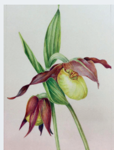
"Yellow Lady's Slipper"