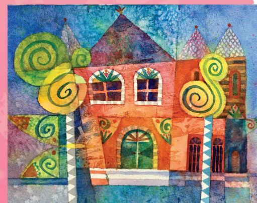
"Castle in the City" watercolor by Tara Sweeney