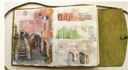
"Italy Pink House" by Pam Luer