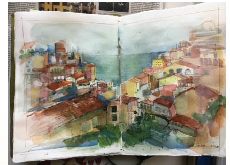
"Cinque Terre Italy" by Pam Luer