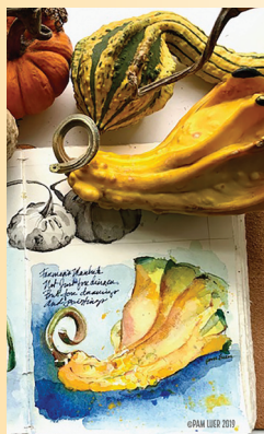
"Those Stems" by Pam Luer. Detail

Check our facebook page for up-to-date events and inspirational artwork shared by members and guests at: www.facebook.com/groups/ MinnesotaWatercolors/