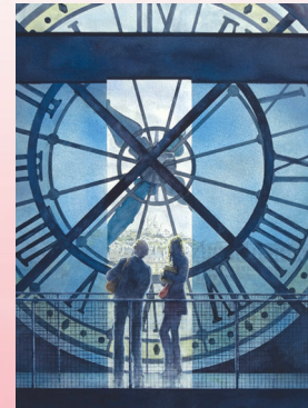
"Paris Times Two"