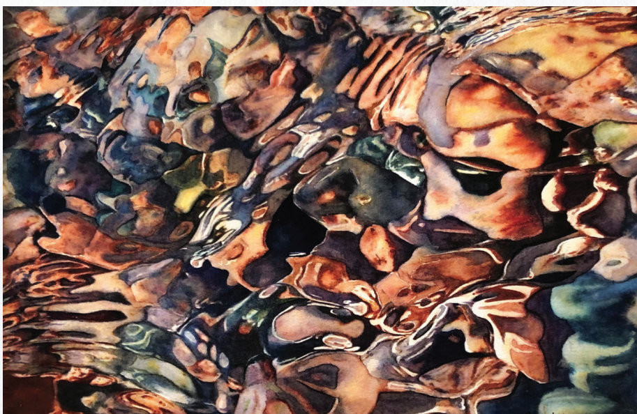
2021 Best in Show award winner, Anne Legeros "Gentle Winds are Blowing"