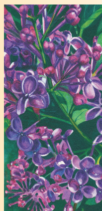
"Fragrant Beauty" by Darlene Mowry. Detail

Check our facebook page for up- to-date events and inspirational artwork shared by members and guests at: www.facebook.com/ groups/MinnesotaWatercolors/