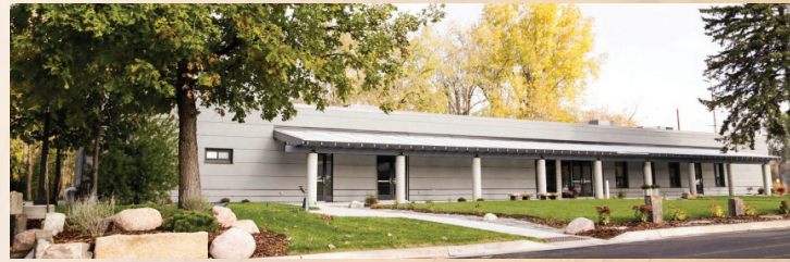
White Bear Center for the Arts