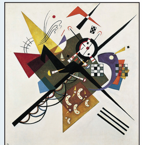
Wassily Kandinsky – On White II

One quote about abstracts from my online research I especially liked is: "True to its name, the definition and approaches to producing abstract art are, well, abstract." (obsessedwithart.com).