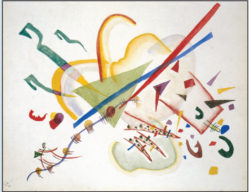
Wassily Kandinsky – Line-color Composition

Per Wikipedia, Wassily Kandinsky (1866-1944) is credited as 'one' of the pioneers of abstraction in western art. He was a Russian painter and art theorist. Kandinsky's definition of abstract art is "art that does not attempt to represent an accurate depiction of a visual reality but instead use shapes, colours, forms and gestural marks to achieve its effect" .