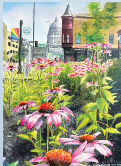
"Boise" by Georgia Kandiko People's Choice Award 2023 Spring Show

Pick up work - No Late Pick Ups: Saturday, May 18, 2024 10 am -1 pm