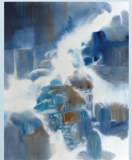
“Rushing Water II” by Suz Galloway, Best in Show Spring 2023

Questions: springshow@minnesotawatercolors.com